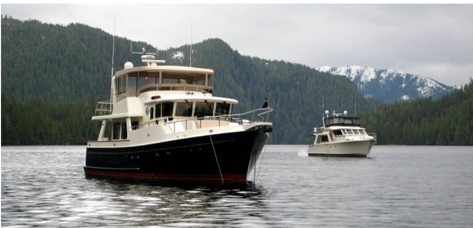
(← The boats at anchor in Klewnuggit Inlet. )

Anyway, the tidal current up the Grenville Channel turned in our favor at 5PM. We continued up to Klewnuggit Inlet, East Inlet anchorage. There was just one boat there, the ubiquitous IMB. We anchored for the night in a very quiet cove.