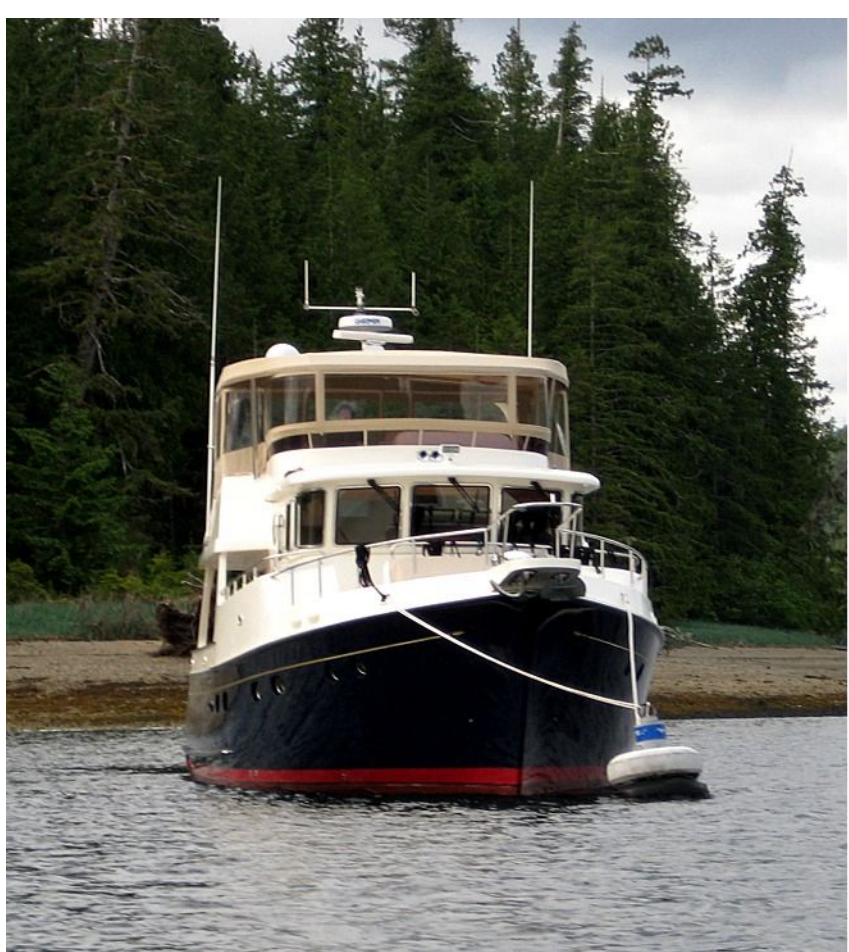
(Wild Blue on the mooring. \rightarrow )