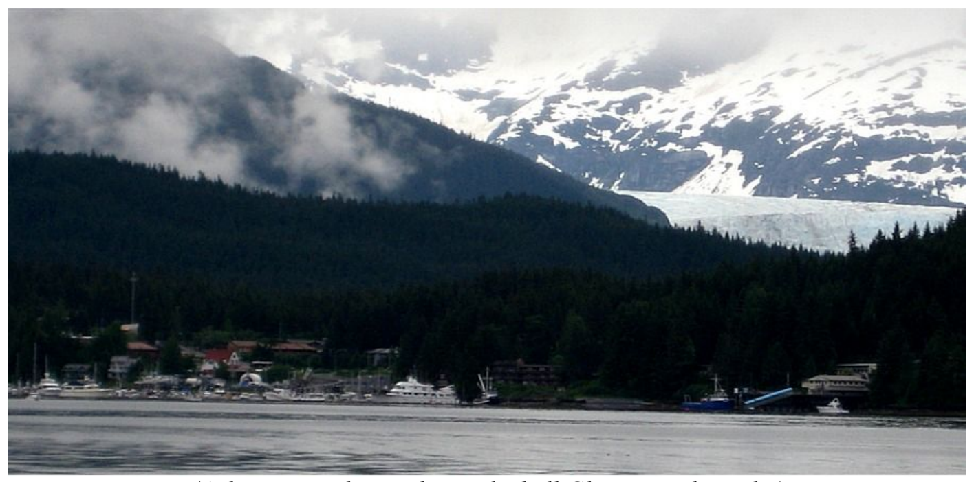
(Auke Bay Harbor with Mendenhall Glacier on the right.)