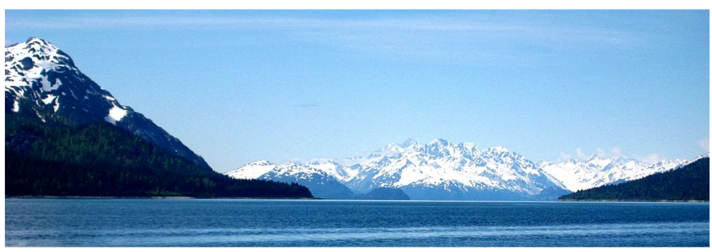
(More spectacular views from Glacier Bay.)