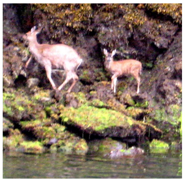
(← Doe and fawn on shore eating algae greet Wild Blue on entering Anna Inlet)

realizing it and releasing another 100-feet of chain, allowing the anchor to re-set. Likewise Seagate drags her anchor about a 100 feet before more chain is played out. The high winds lasts less than an hour, and then light winds prevail, although the boat crews remain on edge. The light rain continues on and off and the storm plays out. Before the day is done, Dick from Seagate visits Wild Blue for a DVD exchange, ready for something besides chick flicks and "My Mother's New Boyfriend", which has ruined Meg