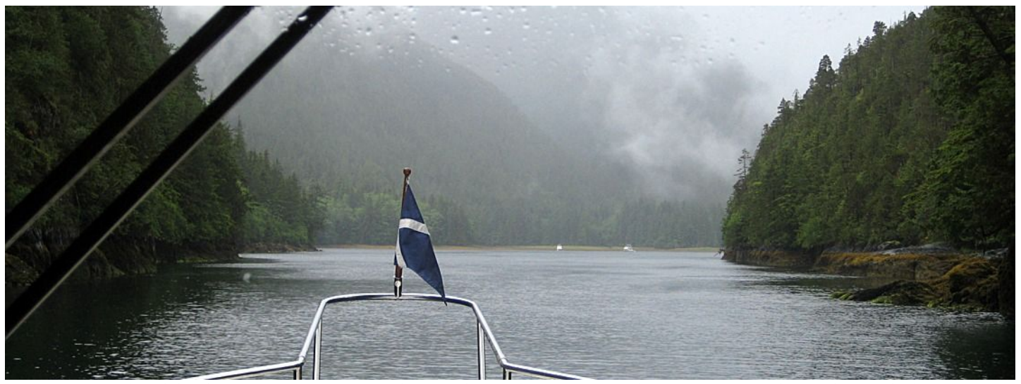
(Wild Blue enters Anna Inlet with Lady Anne and Seagate anchored inside.)

It's oh dark-hundred hours with Wild Blue and Lady Anne preparing for their 45-mile cruise to Thurston Harbour where Seagate awaits them. The sky is gray with clouds and light rain but the wind is also light, so far. Once again we play the "Go North to Go South" game, up Skidegate Inlet, across the shallow bar, then south towards our destination. It takes 10 miles to go one, and then finally we're moving south in sloppy seas, with a 1/2-knot current in our favor.