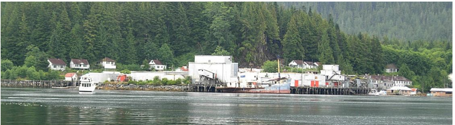
(Below: Seagate motors past the cannery and town of Namu, which needs some TLC.)