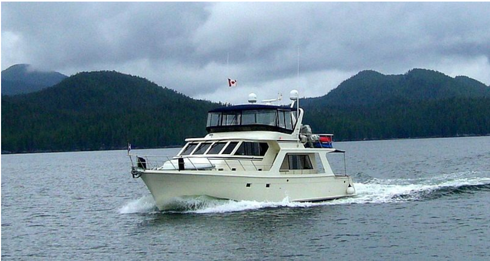
(← Seagate, free of the slower Wild Blue and near numerous fueling locations, runs those diesels at much higher RPM.)