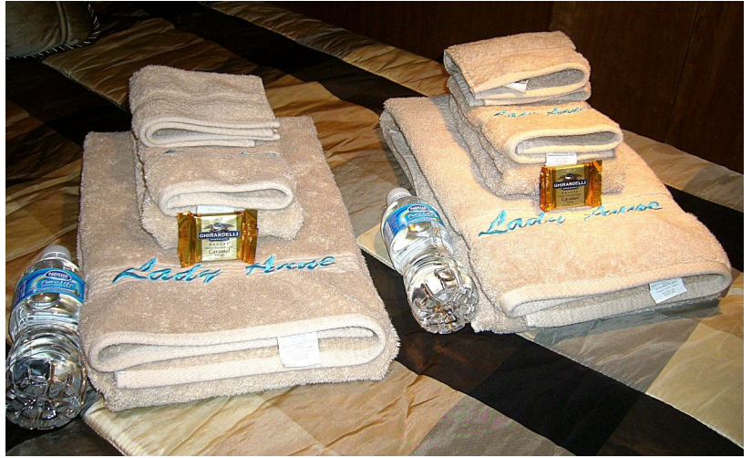
(Above: Guests on the Lady Anne can expect bottled water, fresh towels embroidered with the yacht's name, and Ghirardelli chocolates. Wow!)