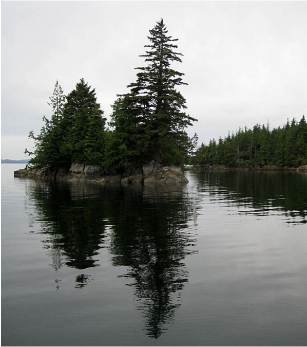
(← The small islet guarding the entrance to Rock inlet.)