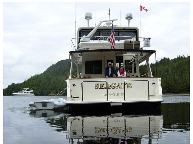
(Below: As soon as Seagate is anchored, the crew immediately launches all its toys.)