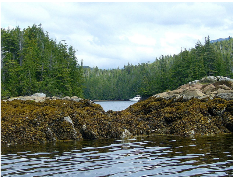
(← Lady Anne is hiding just inside Rock Inlet.)

After Sid arrives, Wild Blue begins moving water and making a wake for Rock Inlet. 25 miles at 9 knots requires about 2 hours 45 minutes. It's near dark when the anchor is finally dropped into the Inlet. It's a magical, quiet place but a storm is brewing tonight. The weather report calls for strong winds beginning tomorrow so our cruise to Duncanby Landing may be a bit bumpy. See you tomorrow.