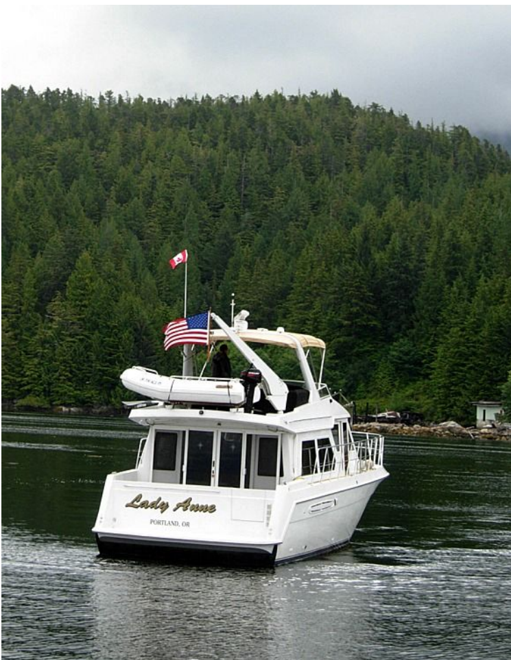
(← Lady Anne has set her anchor in Rock Inlet, just behind Namu.)