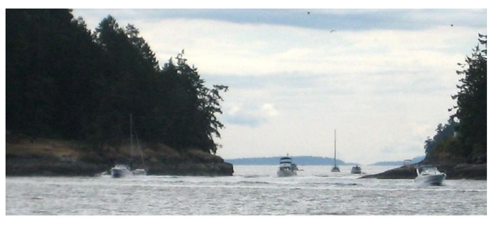
(← Dodd Narrows is busy today. )

Our 10AM departure coincides with slack tide at Dodd Narrows about 5 miles south of Nanaimo. David is photographing on the docks