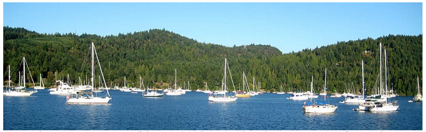
(Above: Just a portion of the over 200 boats anchored in Montague Harbour today.)