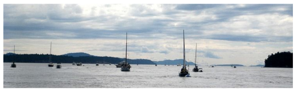
(← Lots of boat traffic for the Narrows today.)

On the south side of Nanaimo is a Weyerhaeuser lumber mill. Logs are fed to the mill from ships and log tows. The