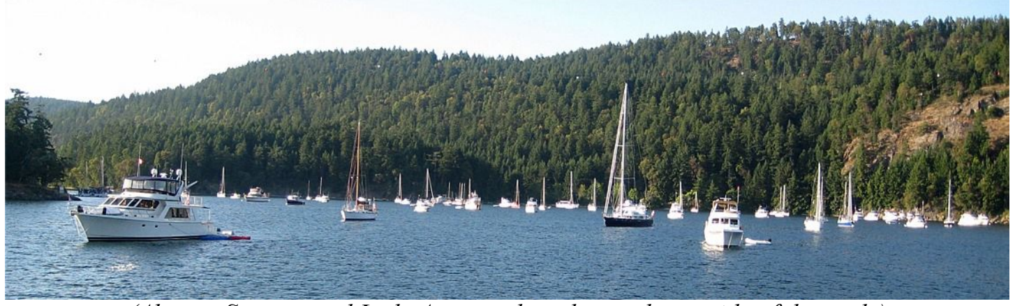
(Above: Seagate and Lady Anne anchored near the outside of the pack.)