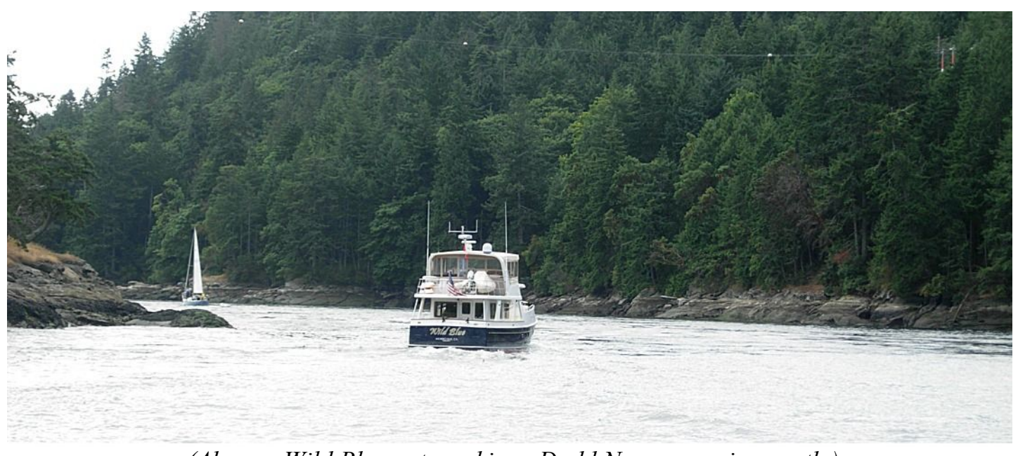
(Above: Wild Blue enters skinny Dodd Narrows going south.)

log tows are disassembled for sorting along the shore just north of Dodd Narrows. Several tugs can be seen sorting logs in close to shore as we pass.