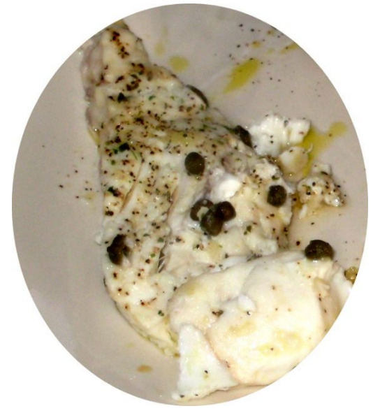
(Fresh Lemon Caper Halibut)